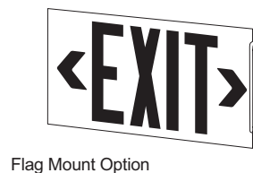
Flag Mount Option